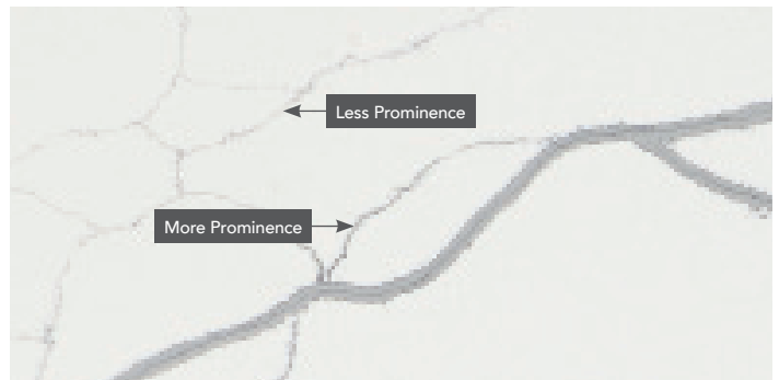
Acceptable Test Sample